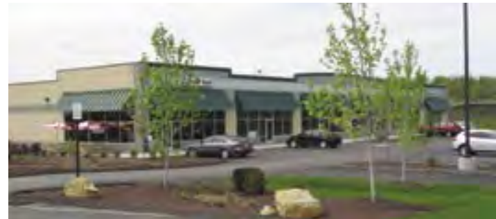
Fay-Penn's new 10,800 sq. ft. Commercial Building, Fayette Business Park

The $1.5 million Fayette Business Park road improvement and infrastructure project began in 2009. The project, consisting of road and storm water management improvements, site grading and the installation of a gravity sanitary sewer line, is being funded, in part, with an Infrastructure Development Program grant from the Commonwealth of Pennsylvania, and a federal Economic Development Administration grant, funded under the American Recovery and Reinvestment Act (ARRA). Construction will begin in early spring and completed by fall 2010.