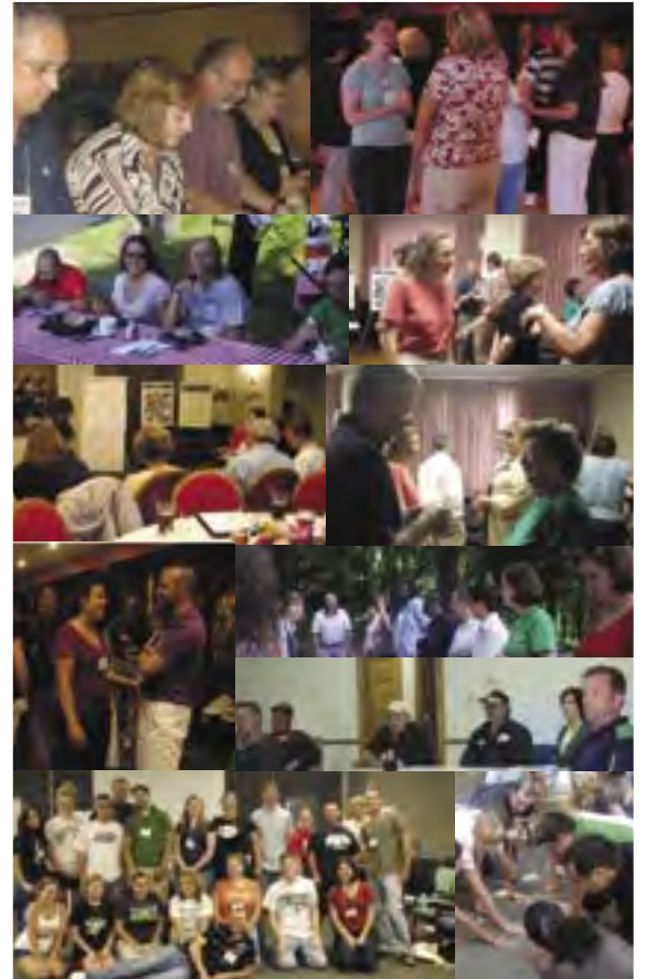
Attendees of Transformational Leadership Training and community meetings held in Fayette County.