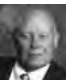
Ed Fike Mayor City of Uniontown