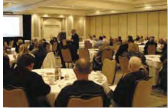
Fayette's first Economic Summit on the Return on Investment in Early Childhood Education - April 11, 2010

Fay-Penn recognizes, with thanks, the generous support and financial contributions from so many companies, individuals and organizations. With their support, REACH is making a difference.